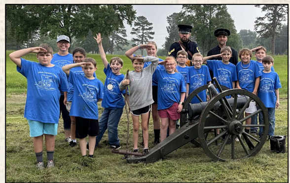
13 students attended the 2024 History Camp

The Fort Towson Historic Site received a $10,000 grant from the Carolyn Watson Rural Oklahoma Community Foundation to support the annual History Camp and to add clothing to the site's living history closet. History Camp is a three-day camp for students ages 9-13. The camp was free in 2024 thanks to the grant. Clothing from the living history closet includes military, women's and children's garments and may be checked out by volunteers to use in OHS programs.